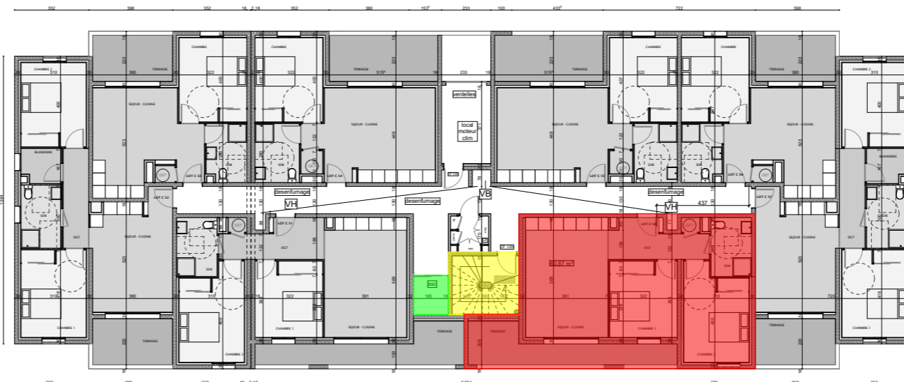
TABLEAU DE SURFACES